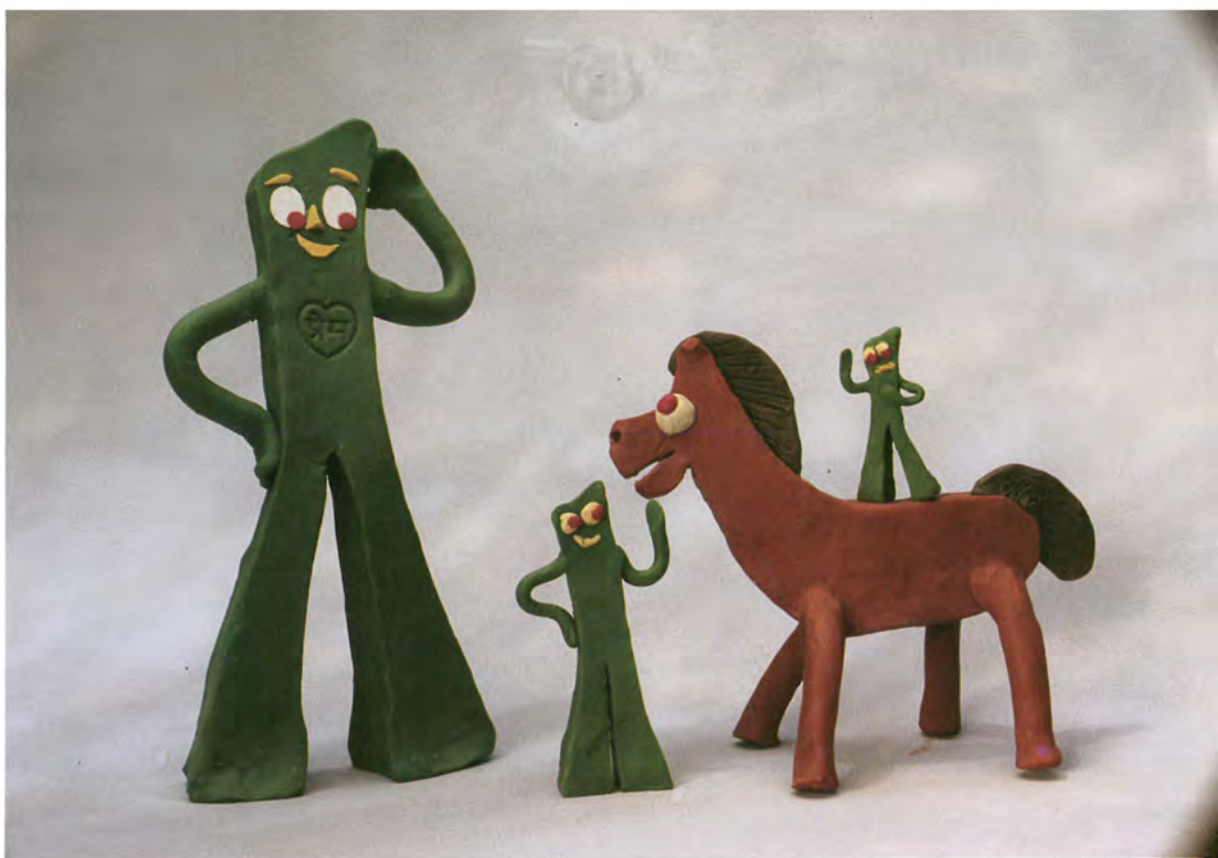
Early Gumby and Pokey models. I found it necessary to have a shape and size that were easily reproduced.