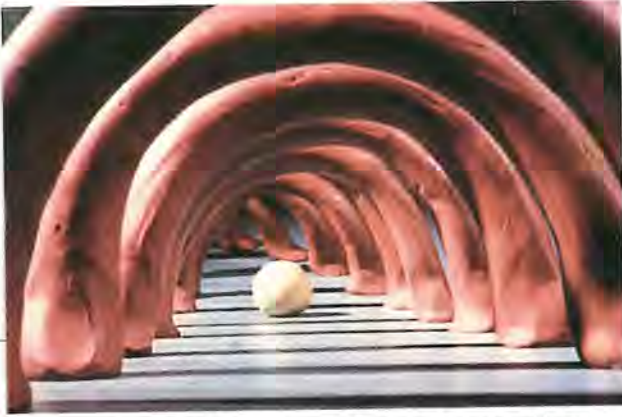
Gumbasia. Geometric and amorphous shapes moved and transformed.

Playboy used that scene in a feature called "Sex in Cinema." (I could never understand why.)