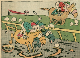
"SHE DOESN'T LIKE TO RUN ON A MUDDY TRACK . . ."